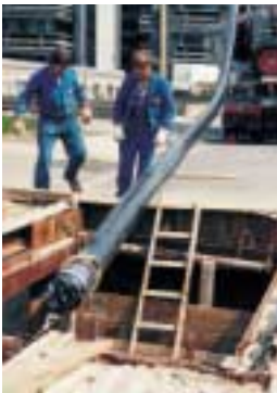
Laying a double-walled FLEXWELL Safety Pipe