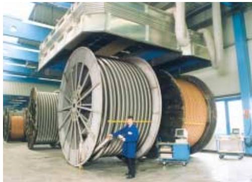
Quality checks, process, pressure and material tests are carried out during the procedure for approval by independent testing organizations and internal quality assurance officers.

The operation of this system complies with the highest European safety level ( Class 1).